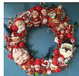
CWL Annual Bazaar This Weekend